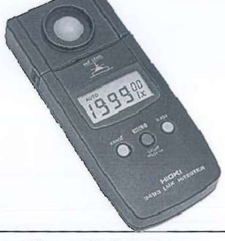
Figure (5): Luxmeter

The lighting in various departments is measured using Lux-meter shown in figure (5).