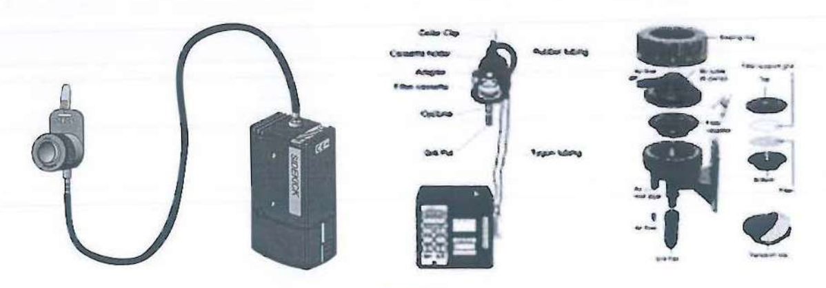
Fig. (1): Air sampling train of Total suspended Particulates

Inside the Lecico Company, different locations were selected for sampling of total and Respirable suspended particulates. The sampling procedures included stationary samples that are collected at fixed places representing all work conditions. The sampling train consists of pump, filter holder and in case of Respirable particulates a cyclone is added as illustrated in figure (1). The sampling train must then be calibrated using wet gas meter. The stationary sampling system was at height of about 1.5 meter to represent the breathing zone. Samples were collected for 2-3 hours using membrane filter. The concentration of TSP was determined gravimetrically in mg/m<sup>3</sup>.